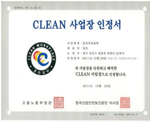
Certificate of CLEAN workplace